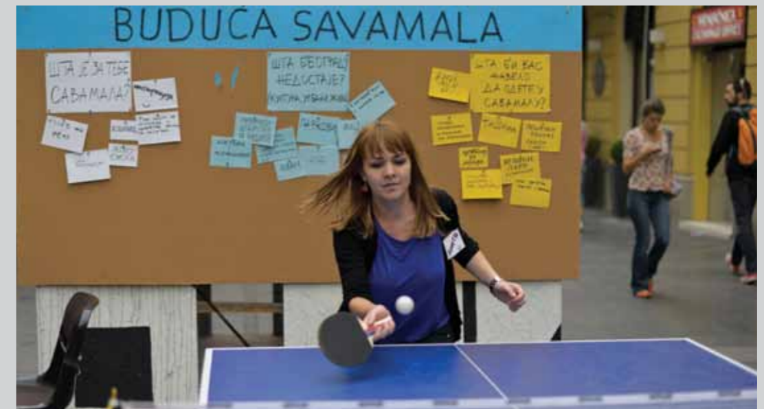
Table Tennis at Knez Mihailova street, Photo: Nebojša Vasić © Goethe Institut

Belgradians felt that they would be motivated to go down to the river if it would be better maintained, have cleaner facades, but also if the heavy traffic would be relocated. Some citizens are wishing an art quarter to be formed there, which would resemble similar places in Berlin or Amsterdam, and the others wish an open cinema and amphitheater, as well as a sofa-bar. By the opinion of many, mostly younger citizens, what lacks in Savamala are the sports courts – for example, a table-tennis court. The rest of them would be satisfied simply by – the silence.