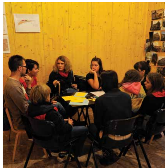
Nextsavamala workshop at Days of Savamala

The next step after publishing the Nextsavamala Citizens' Vision would be the realization of its projects: Debating the Vision and working on making the projects real.